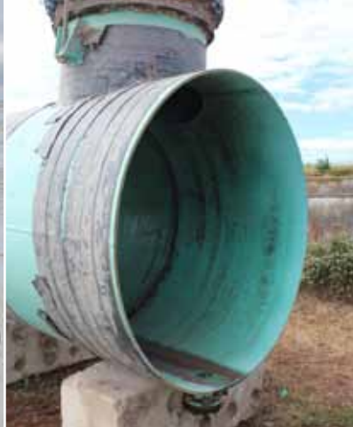
Cold Cut Coated Steel Pipe