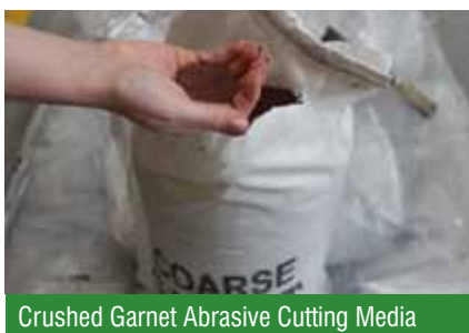
Crushed Garnet Abrasive Cutting Media

At the nozzle tip a small quantity of garnet is fed at a metered rate into the water stream to produce a high velocity abrasive cutting jet. Crushed garnet is a hard, angular, sharp mineral available in graded sizes. This enables it to pass through a small diameter nozzle without clogging.