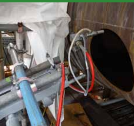
Cold Cutting Hole into Cylindrical Steel Vessel