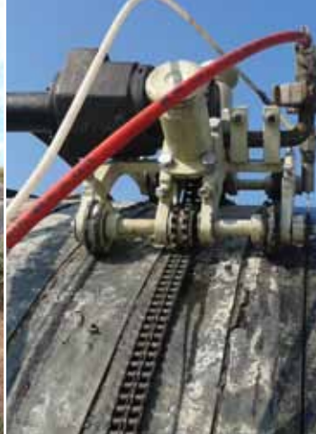
Jetnife Pipe Cutter