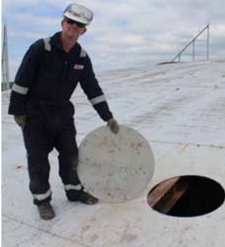
Coupon Removed from Gas Holder Crown