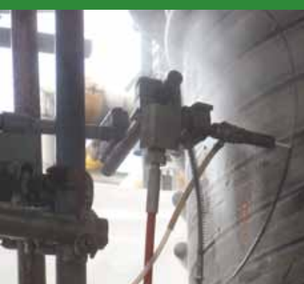
Abrasive Water Jet Cutting Hole in Vessel at an Oil Refinery