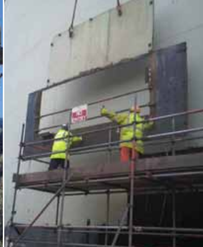
Cold Cut Side Sheet Heavy Oil Storage Tank