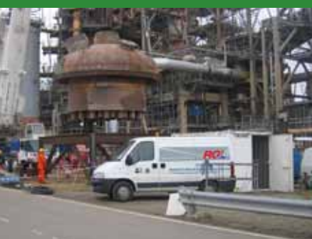
Cold Cut to Remove Cat Cracker Head