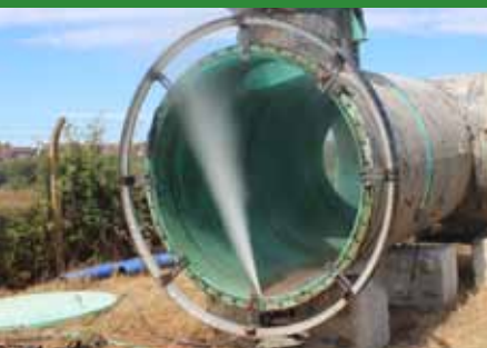
Large Diameter Pipe Cutting / Flange Removal